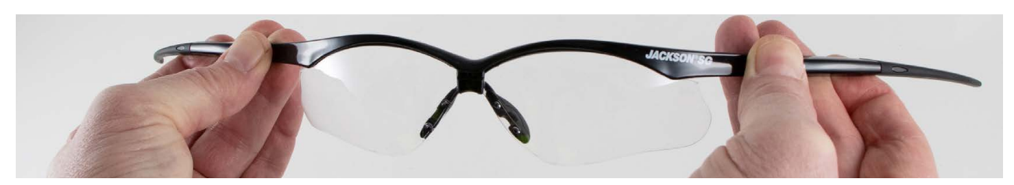
Unmatched Frame Durability From the Only Genuine Jackson Safety Brand Eyewear!